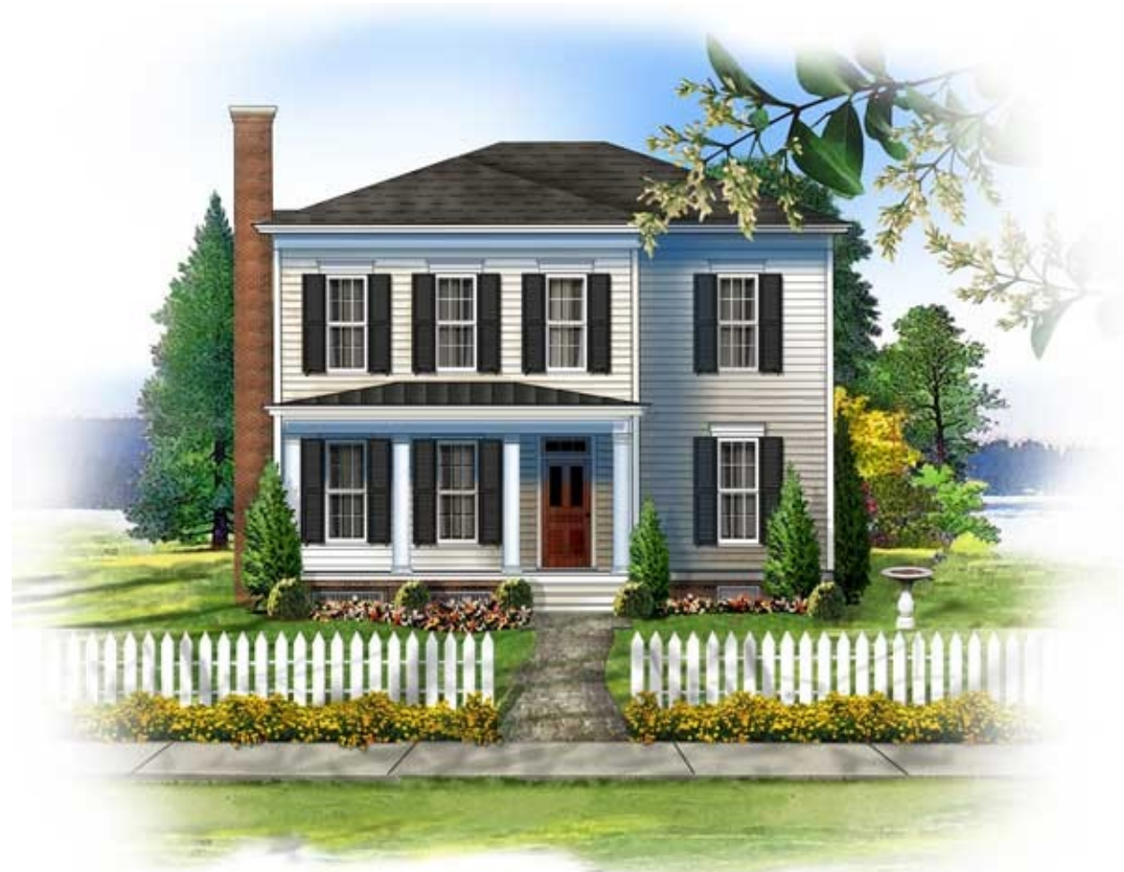
Hinsley Park 2855 SF